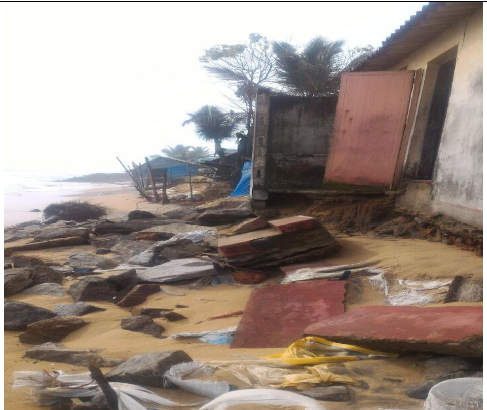
Some realities from the field