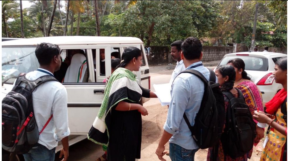
Panchayath President and secretary making travel arrangements to the fields