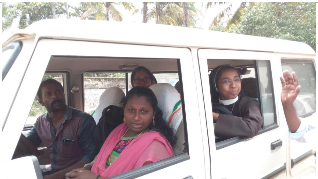
Travel to field for ODF campaign