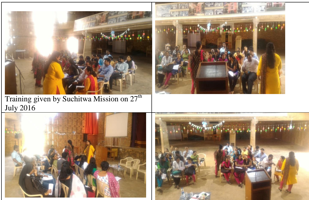
Training given by Suchitwa Mission on 27 th July 2016

As part of this ODF survey, training was conducted for students by resource persons from Suchitwa Mission on 27 th July 2016. They explained about the programme and the purpose of the survey