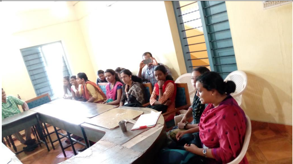
Discussion with Panchayath officials at Anjengo grama Panchayath