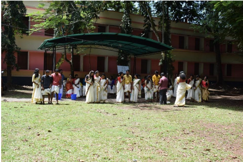
Onam Competitions 2017-18