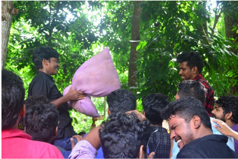
Thalayinathallu (Pillow Fight)