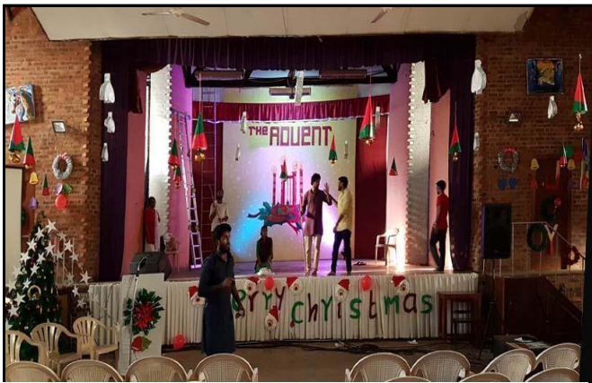
The Advent Christmas 2018

Feliz Navidad 2020, Yuletide 2016, Advent 2017