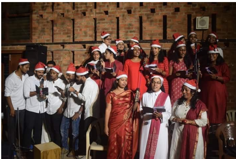
Carols at Amour 2020: Staff and Students sign in Chorus

Every year, Christmas is a time when Loyola looks 'the most beautiful'. Cultural events, decorations and the grand feast all prepared painstakingly by the students generates tremendous enthusiasm, team-spirit and bonhomie among the Loyolites. Cultural events include carol singing, nativity scenes, pantomimes and dance colours the festivities. The students total involve either in organizing or in participating in these activities; this enables them to develop life skills – communication, team working, conflict resolution, negotiation, consensus-building, etc. as well as it give them a hands on experience in programme management.