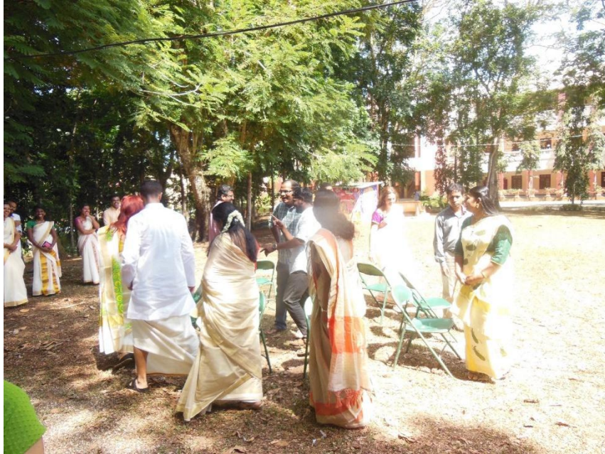
Kaserakali - by faculty members Onam 2016

The vital fact is that, Loyola College of Social sciences entertains cultural events and competitions for the purpose of revisiting Kerala's heritage and culture. The Campus community participates in these programs in the entirety with the student community taking lead in hosting the competitions and the Ona-sadya (feast) served with 21 items with at least 3 payasams.