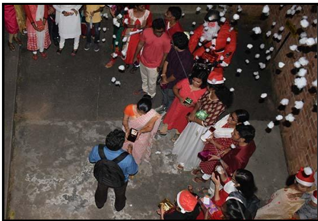
Gift Exchange 2017