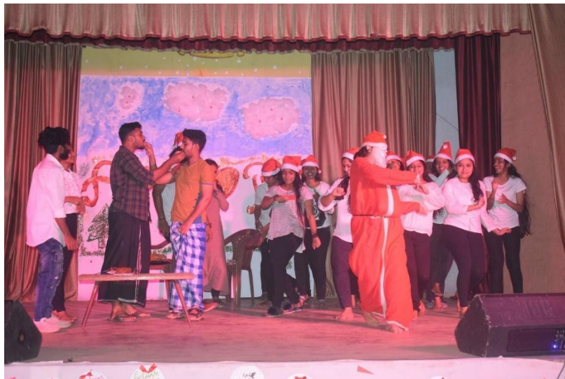
A skit highlighting the plight of our NRIs during COVID