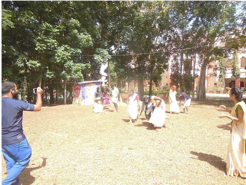
Chakkilottam - Onam 2016