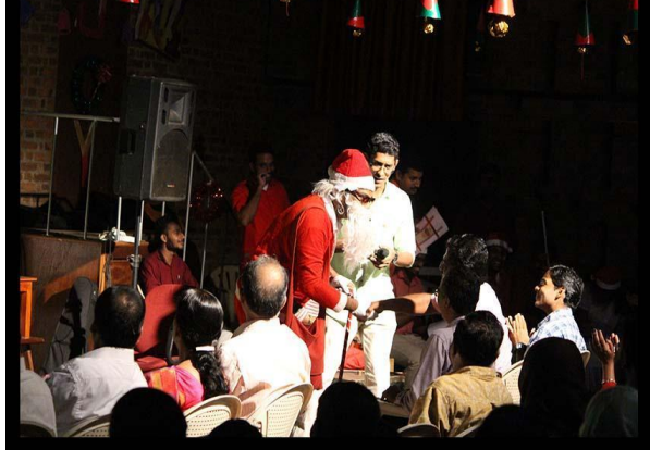
Santa arrives and in a jovial company, Christmas 2016