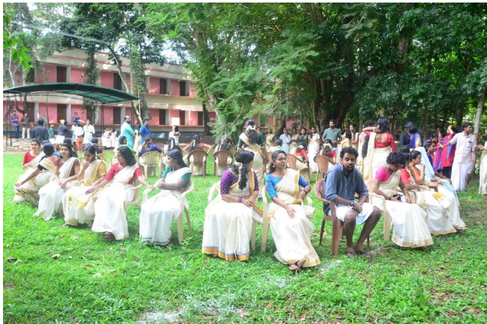
Kaserakali (Musical Chair)