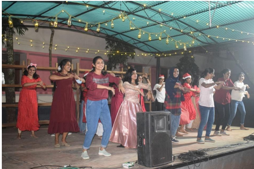
Ladies Hostellers 'shake a bone' firing up the culturals; Amour 2020