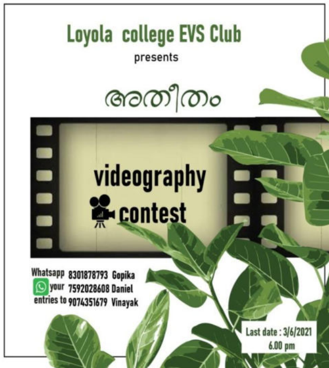
Announcement on Videography Contest