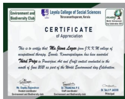
Certificates issued to winners