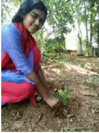
9. Anjima MS (31/05/2020) at 10:20 pm