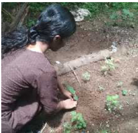
11. Shilpa V (1/06/2020) at 5:21 pm