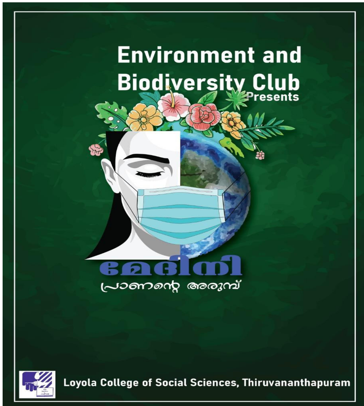
Cover Page of Magazine – Loyola Biodiversity & Environment Club