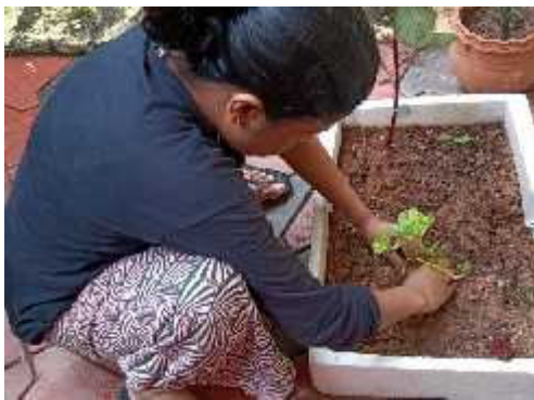
13. Feba KR (2/06/2020) at 5:47 pm