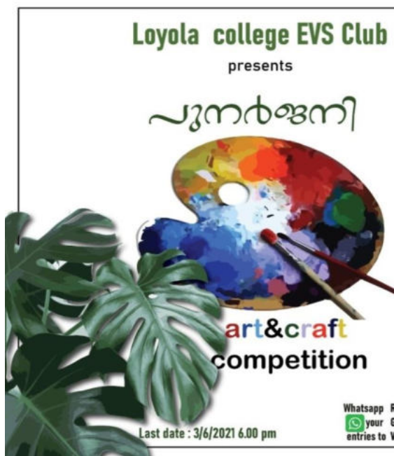
Announcement on Arts & Craft Competition