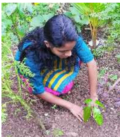
17. Archana AB (4/06/2020) at 5:41 pm