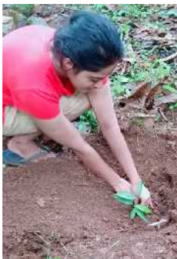
16. Kavitha K (3/06/2020) at 10:45 am