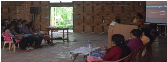
One day Interactive English Workshop on 27 th Sept, 2019.